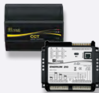
Pulse concentrators & data collection units