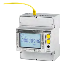
ULYS TT Ethernet