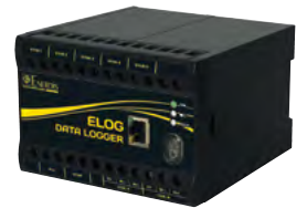
ELOG DATA LOGGER

The CCT and ENERIUM 210 pulse concentrators and data collectors continuously store the information from meters (pulse output) or from temperature and flow-rate sensors (0-20 mA / 4-20 mA signals). The data can be retrieved remotely from these units, which are equipped as standard with an RS485 ModBus or Ethernet ModBus TCP output.