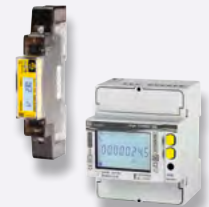
Submeters and tariff meters